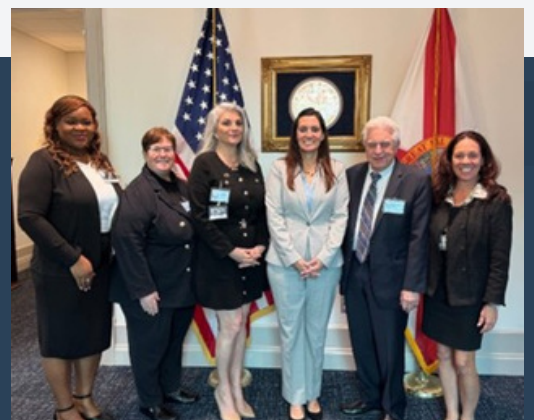
FSGA meeting with Lt. Governor Jeanette Nuñez